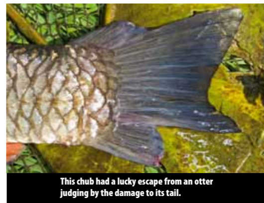
This chub had a lucky escape from an otter judging by the damage to its tail.

When I hooked my next fish I knew straight away that it was a barbel as it shot straight downstream, mid-river, rather than trying to get in the snags