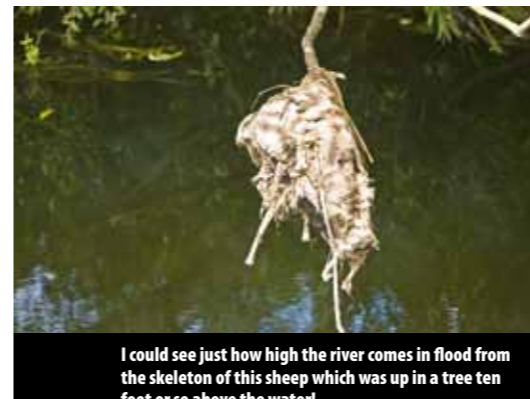
I could see just how high the river comes in flood from the skeleton of this sheep which was up in a tree ten foot or so above the water!