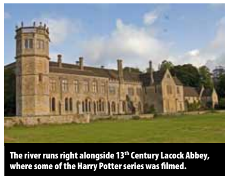
The river runs right alongside 13 th Century Lacock Abbey, where some of the Harry Potter series was filmed.

“First of all it was just a couple of chub that showed, but then several barbel turned up, at least one of which must have been a double.”