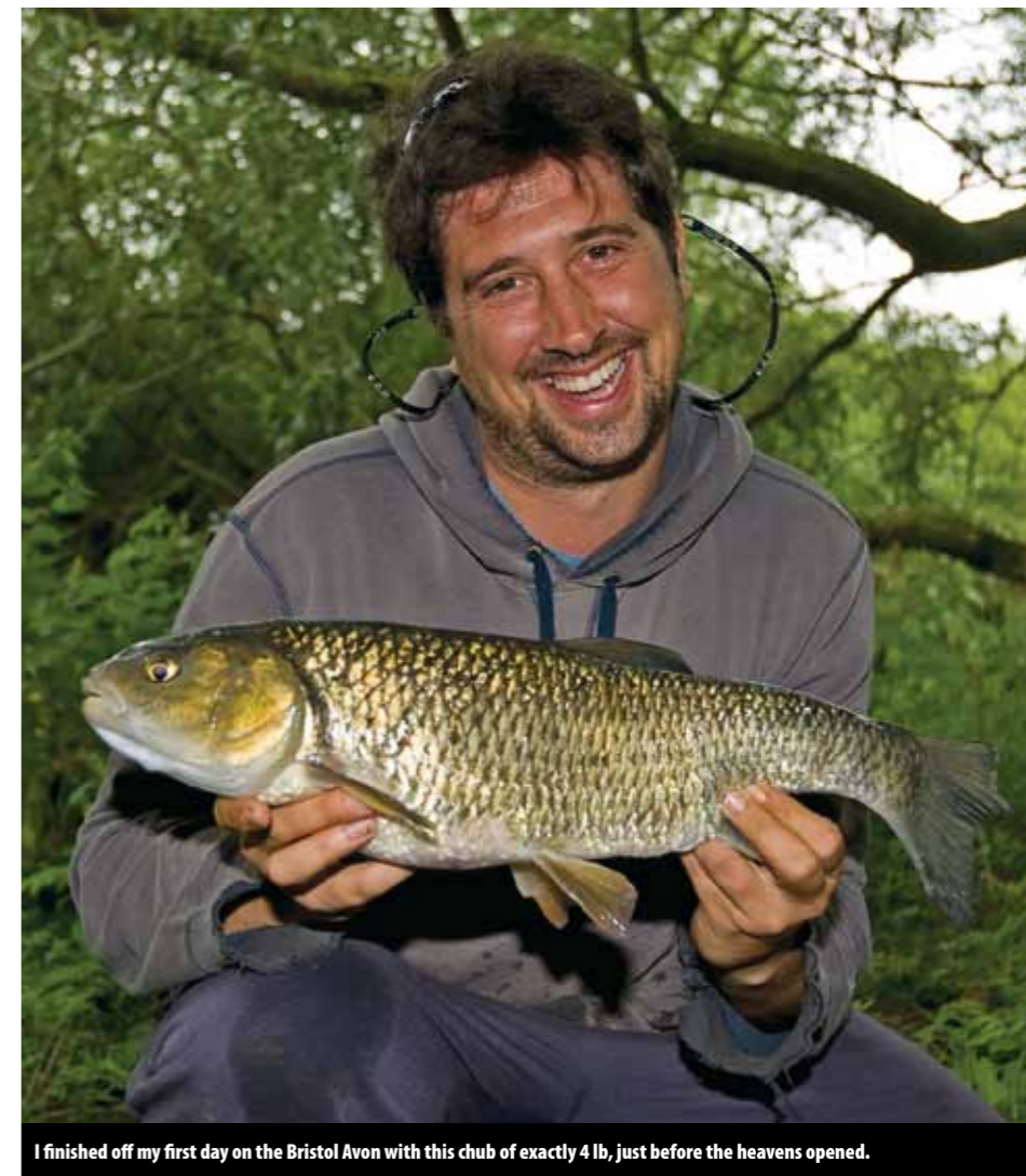
I finished off my first day on the Bristol Avon with this chub of exactly 4 lb, just before the heavens opened.

This time we’d be fishing upstream from the bridge in the grounds of Lacock Abbey, which was a magnificent sight. It was built in the 13th Century and the monks introduced carp to some of its stew ponds at around that time. It has also been used in the filming of the Harry Potter series.