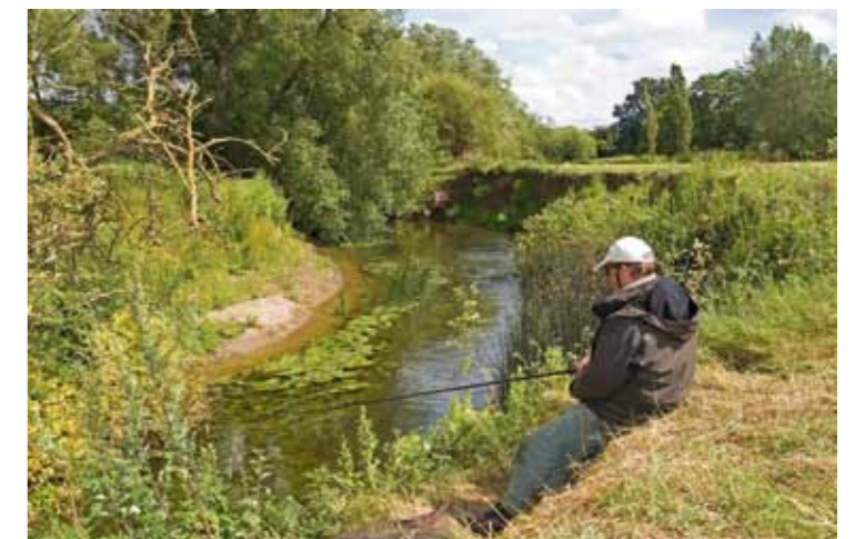
The banks of this particular stretch of the Bristol Avon are steep and the river gin clear, so it is vitally important to keep as low as possible – hence sitting on the ground.

I've caught fish from many different rivers around the country, but the Bristol Avon was one that I had missing from that list.