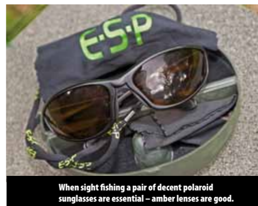
When sight fishing a pair of decent polaroid sunglasses are essential – amber lenses are good.

and, although no monster at around 3 to 4 lb, I was happy to get my first one from the Bristol Avon. I followed it soon afterwards with another slightly bigger one.