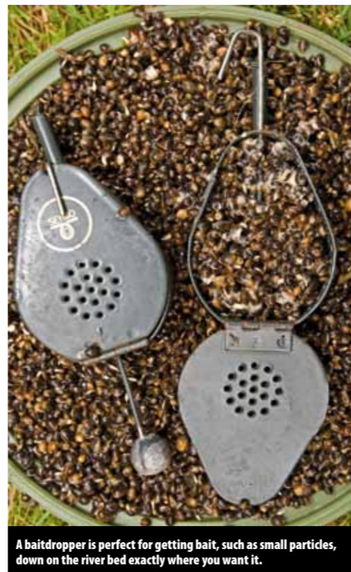
A baitdropper is perfect for getting bait, such as small particles, down on the river bed exactly where you want it.

I hooked on a small PVA bag of pellets and, as the fish were on the spot and I didn’t want to cast on top of them, I used a trick from when I used to stalk carp. By flicking a couple of 6 mm pellets at a time right on top of them it was enough to semi-spook them. Then, as soon as they drifted off downstream,